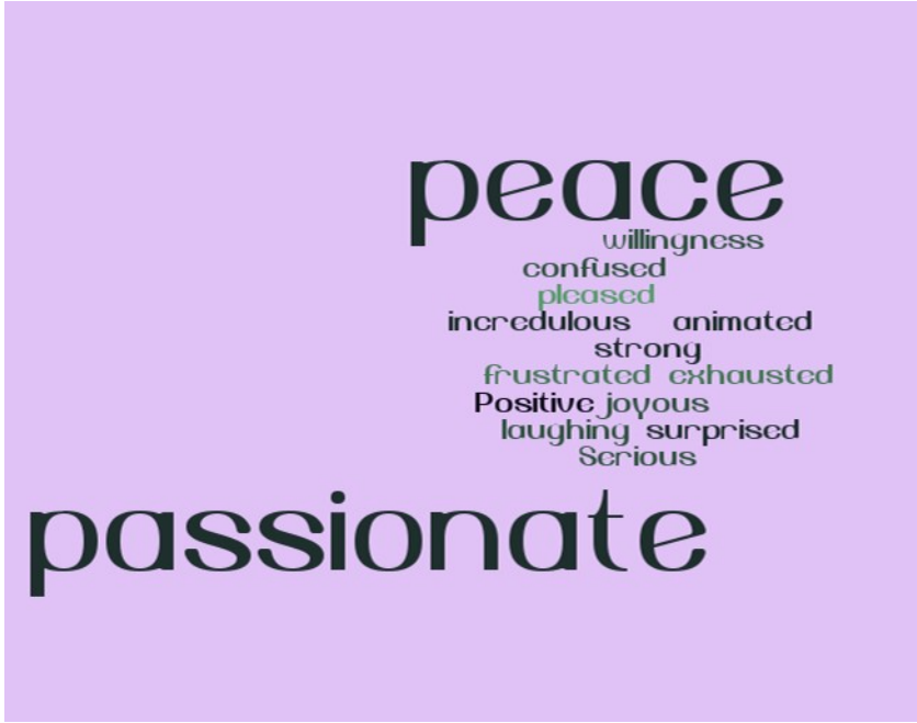
↑SAME SEX MARRIAGE