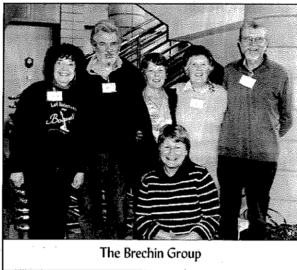
The Brechin Group

The conference proved to be a great success, old friendships were renewed and new ones forged. We left on the Sunday invigorated and strengthened by the Primus' regard for the work and dedication of Lay Readers and inspired and encouraged by the experiences of our fellow Lay Readers.