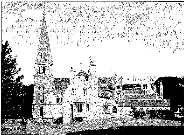
The Cathedral of the Isles & Collegiate Church of the Holy Spirit, Isle of Cumbrae

Come as an individual, a couple or a small group and be part of a midweek or weekend retreat at the College of the Holy Spirit led by the Warden. Adjust your pace of life to a few days of saying the Daily Office, Midday Eucharist with a visiting celebrant, a little intellectual stimulation, lots of time for reflection and recreation and good home-cooking.