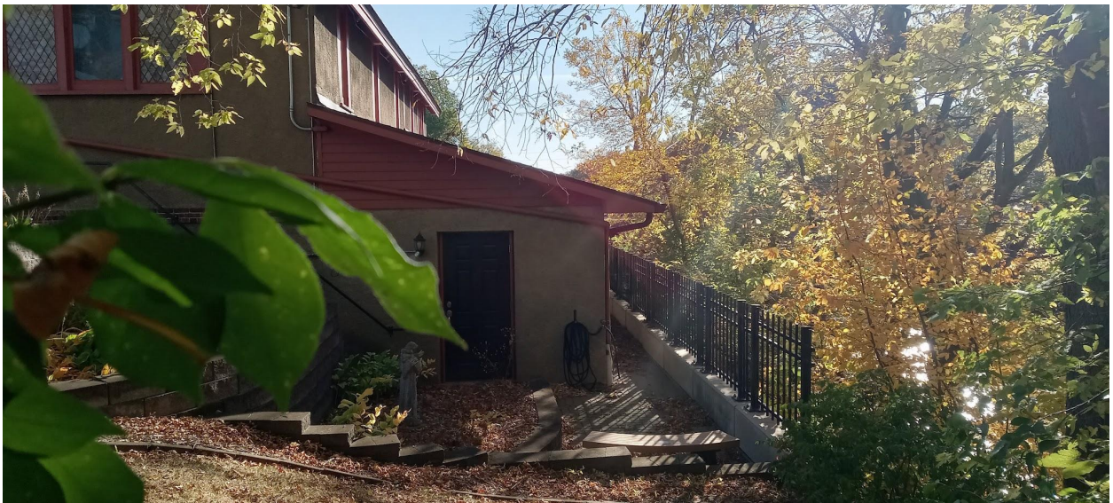
Here is another link to a recently created YouTube Video that shows the natural beauty of the town.